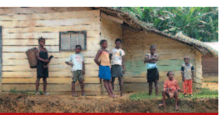
Road construction is a real amusement for local kids