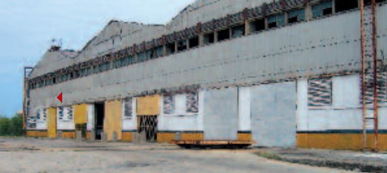
A future enterprise for the KrAZ vehicles modernization in the town of Cienfuegos