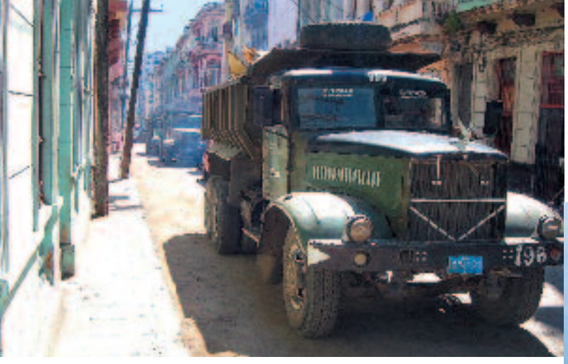
A string of KrAZ municipal old-timers removing construction waste in the center of Havana