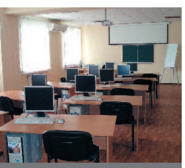
Computer class of the training unit

A new training unit of "AvtoKrAZ" opened its doors. The present unit claims to be the best one in the territory of the former Soviet Union.