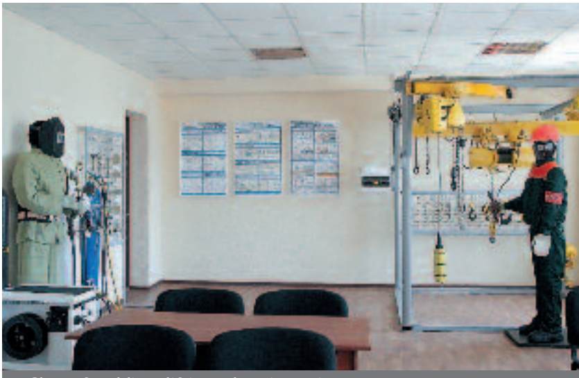
Class of welding, lifting, electric equipment and pressure vessels

Different courses improving a qualification of "AvtoKrAZ" HC specialists are carried out for engineers and technicians in the training class.