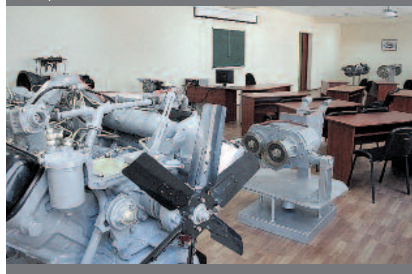
Split units and devices in the automobile class